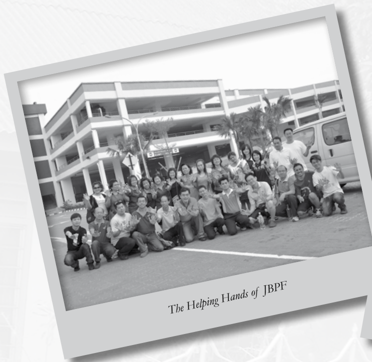
The Helping Hands of JBPF