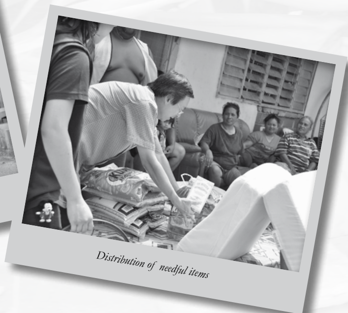
Distribution of needful items