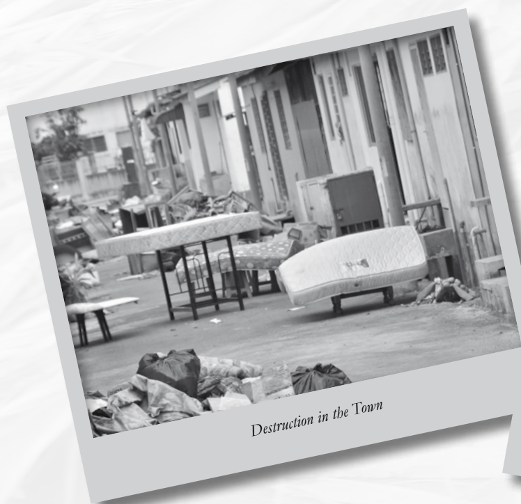
Destruction in the Town