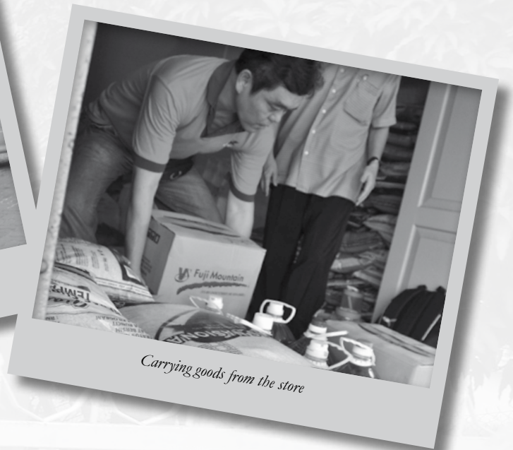
Carrying goods from the store