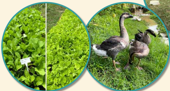
L to R: Thriving organically grown vegetables ready to be harvested (L). Geese and duck ranging freely at the stream.(R).

The Covid-19 pandemic exposed the risk of concentrating economic growth in cities, with smaller towns hollowed out by rural-urban migration. As a result, small-town economies are unable to provide sufficient jobs for the local population. When cities are overpopulated, one of the challenges faced by the urban poor is malnutrition due to reliance on cheap, processed food. This contributes to chronic health issues which burden the healthcare system.