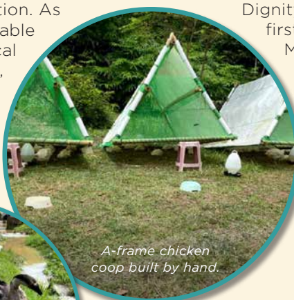
A-frame chicken coop built by hand.

Dignity Farm Academy is also home to the first granite skate park built by Vans Malaysia, which co-organised a skate camp there in May 2022. Besides learning to skate, participants learnt woodworking and built their own stool from a skateboard.