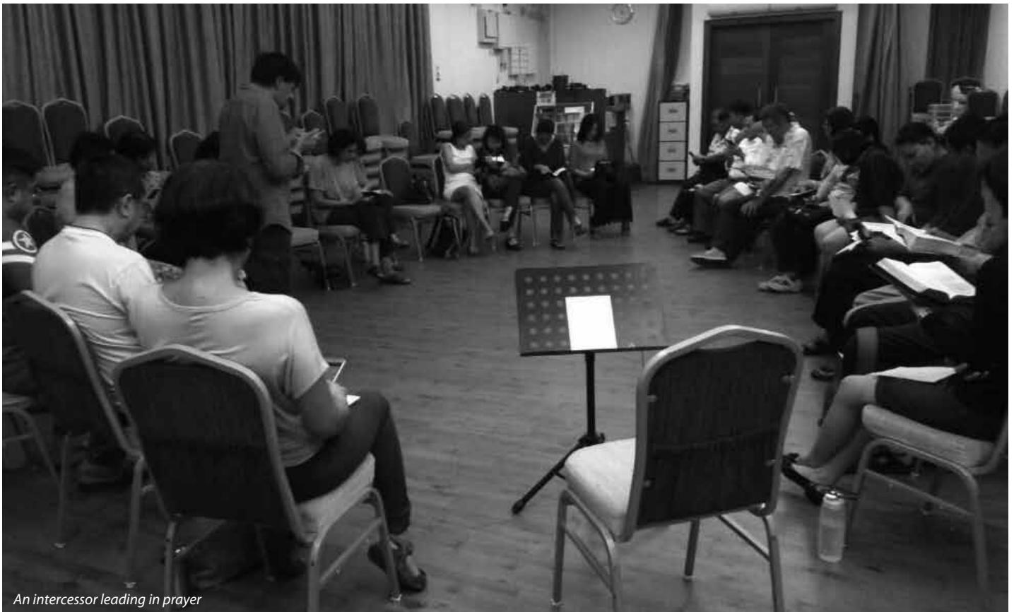
An intercessor leading in prayer

I have not quite made sense of the above phrase which was dropped into my spirit when I was communing with the Lord a couple of evenings ago. Grammatically, I would think it should be "Run with the River. Run." I believe God is in the acceleration mode, and I must make sure I am fit and my running shoes are on.