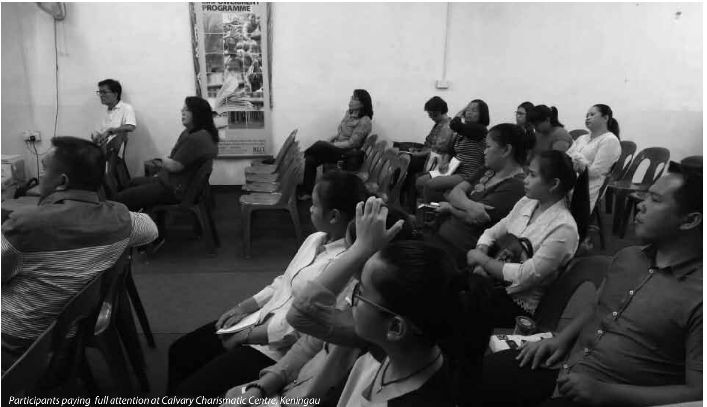
Participants paying full attention at Calvary Charismatic Centre, Keningau