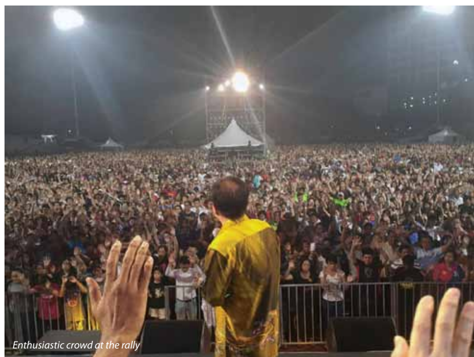
Enthusiastic crowd at the rally

The move of God over the last weekend was definitely predominantly fruit from the labour on bended knees.