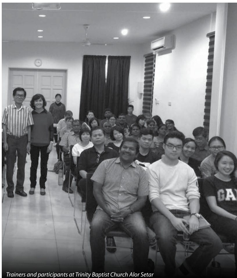
Trainers and participants at Trinity Baptist Church Alor Setar

R EEP continued with its great start in the year 2017 with training sessions of volunteer tutors in Kuching at the Latter Rain Church on 22 April. This was followed by training sessions in Petaling Jaya at Grace Assembly of God (AOG) Church on 10 May, in Alor Setar at the Trinity Baptist Church on 20 May and in Keningau, Sabah at the Calvary Charismatic Centre on 17 June.