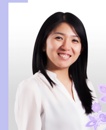
Yeo Bee Yin "Discovering Your Destiny"

Yeo Bee Yin studied Chemical Engineering in Universiti Teknologi Petronas under a Petronas Scholarship and was the top graduate of her year. She subsequently obtained her MPhil in Advanced Chemical Engineering in Cambridge University under the prestigious Bill & Melinda Gates Foundation Scholarship. After meeting so many young and bright Malaysians who left home for better opportunities abroad, Bee Yin realized that the nation could end up in jeopardy if this unhealthy trend continued. Hence she joined the political party, DAP, to make a change. Since joining DAP, she has lent her expertise in social media to help DAP reach out to the younger generation. Bee Yin also has a strong interest in environmental, sustainability and energy policy, and believes that this has been an area generally neglected by politicians. She takes part actively in policy-making so that we can have a greener Malaysia, as we move forward in global economic development.