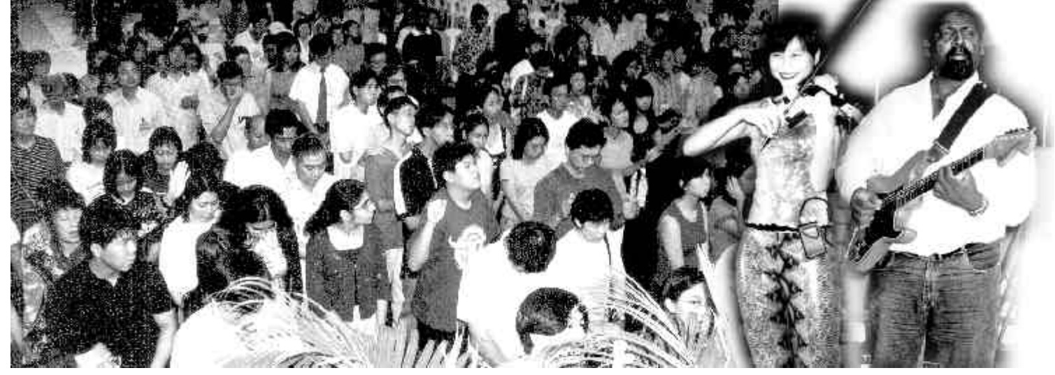
A sombre moment for the crowd that responded to the Word.