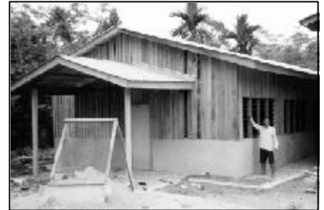
Above picture was taken shortly before the attack. Below – flattened within a few minutes, five days before their first worship service in the church. The scheduled inaugural service was instead held under the trees nearby.