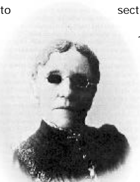
Fanny Crosby was blind from six weeks old. She returned to the Lord at the age of 95.

For preachers, you can pick a hymn to accompany your message by clicking on the section "Scripture Allusions". This