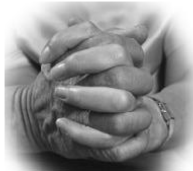
Praying for those who serve you is one way of showing your support to them.

• "Elders who direct the affairs of the church well are worthy of double honour, especially those whose work is preaching and teaching" (1 Tim. 5:17). You can honour them by your faithful attendance in church and by putting into practice the Word they have taught you.