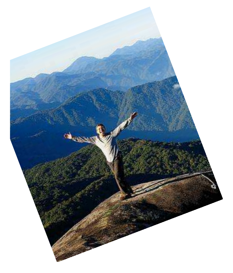
An Introduction to Administrative Leadership