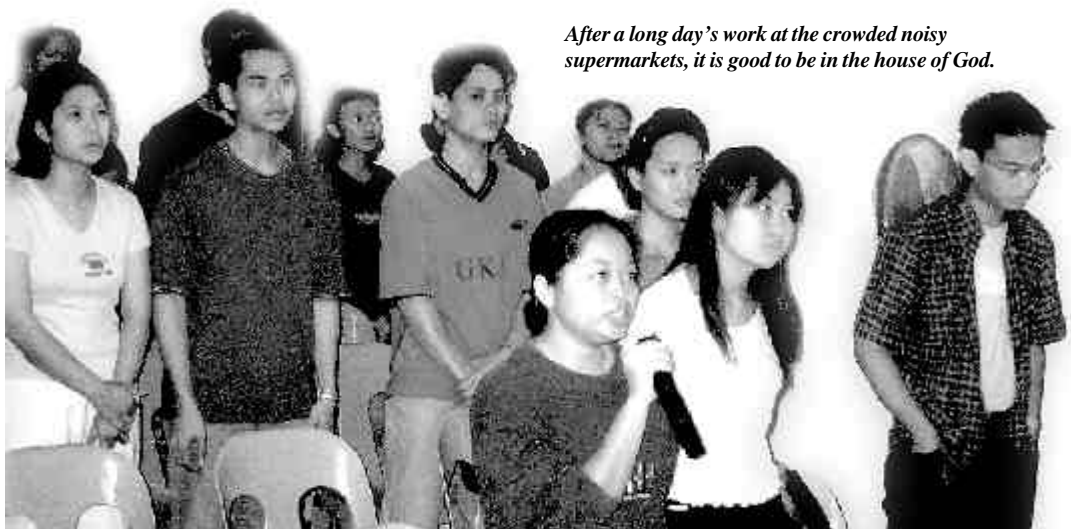
After a long day's work at the crowded noisy supermarkets, it is good to be in the house of God.