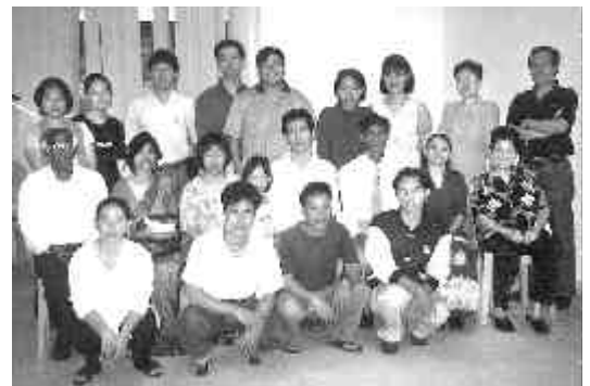
Not only has the 'supermarket fellowship' grown up into a church, it has outgrown its sector to include workers from a car accessory shop and university students.