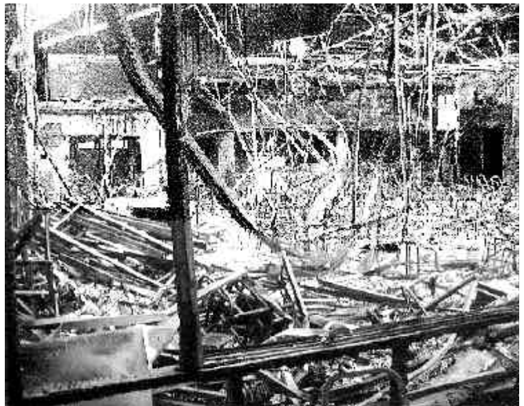
Mangled mess – what’s left of Christ Community Centre in Subang Jaya, Selangor, which was razed to the ground in a pre-dawn blaze last October.

Dato’ Seri Badawi, who is also the Deputy Prime Minister, briefed them on the status of police investigations and said that so far, police had found no link between the arson attacks and anti-Christian sentiments. He advised that the attacks were isolated cases with specific problems related to the churches concerned.